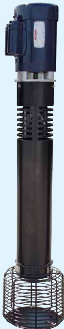
1/2 Hp. MODEL BE Capacity: 340 gal./min.