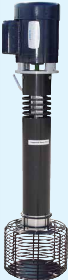
1/3 Hp. MODEL AE Capacity: 225 gal./min.

All aerators are 60 hz, 115/230 volt, single phase.