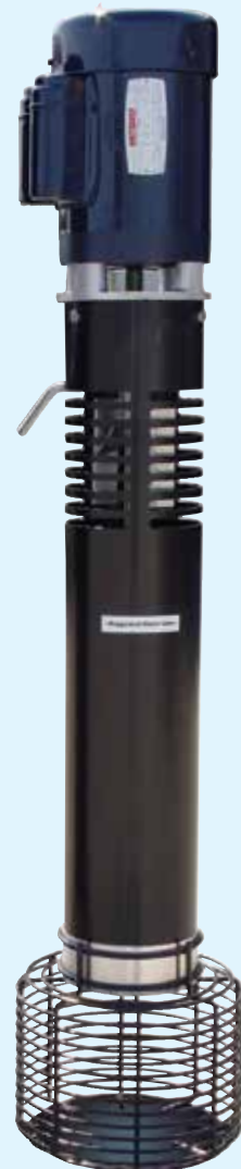
1 Hp. MODEL BTE Capacity: 550 gal./min.